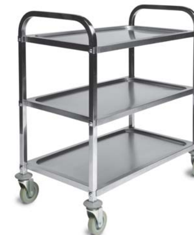
Stainless Steel Service Cart Catalog Number: 6300 36"H x 35"W x 21"D