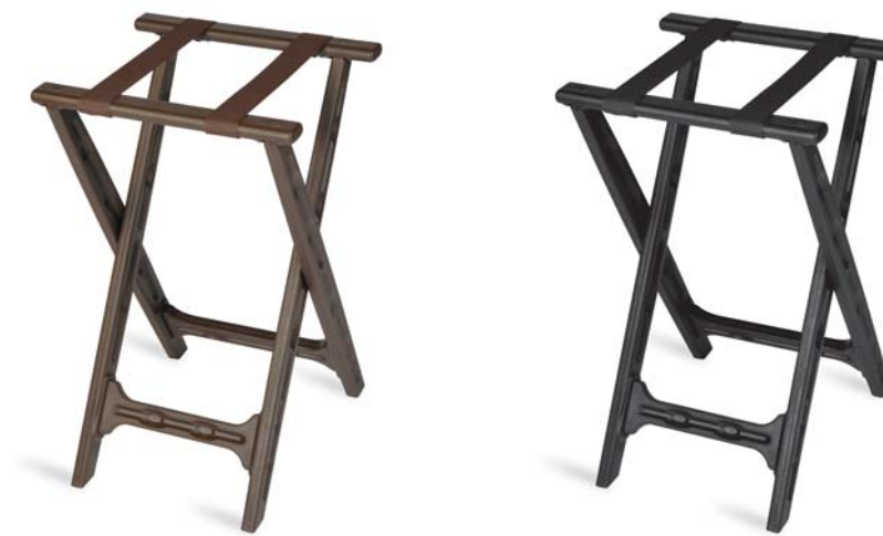
Plastic Tray Stand Catalog Number: 1500BRN 30"H x 18.5"W x 17.25"D