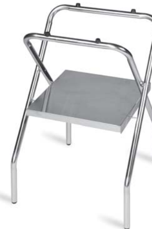
Folding Tray Stand / Bright Zinc / Stainless Steel Shelf Catalog Number: 1054S-C 30.5"H x 20"W x 15"D