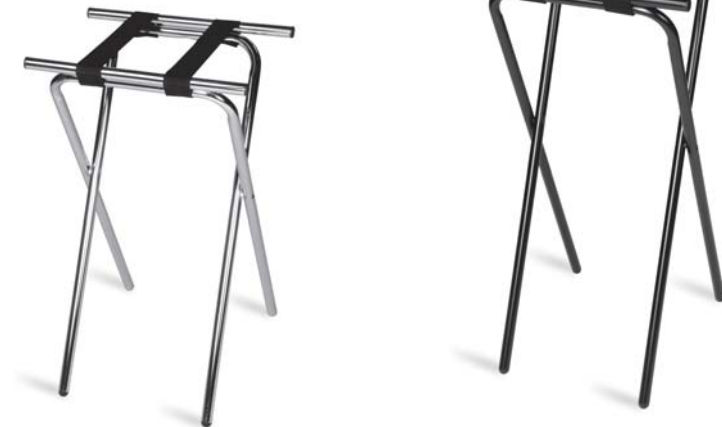
Deluxe Steel Tray Stand Catalog Number: S1053C Bright Zinc 36"H x 19"W x 15"D