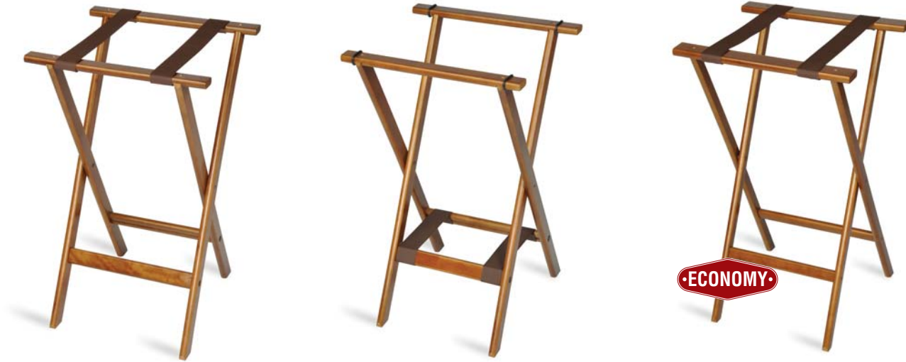
Deluxe Wood Tray Stand / Steel Support Rods Catalog Number: 1170 30"H x 18.5"W x 17"D