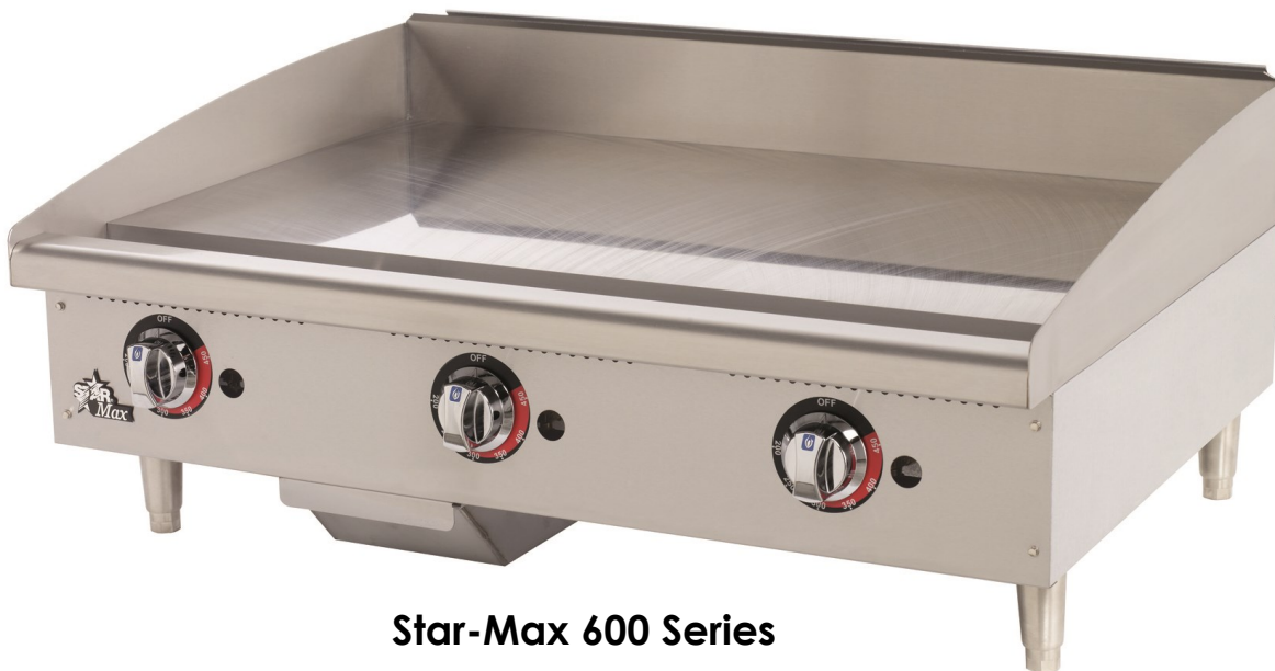
Star-Max 600 Series Snap-Action Griddles

Available in 15", 24", 36" and 48" widths.