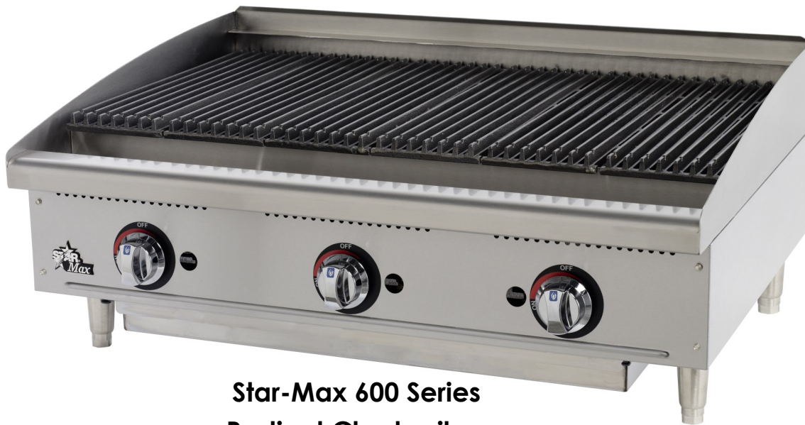
Star-Max 600 Series Radiant Charbroilers

Available in 15", 24", 36" and 48" widths.